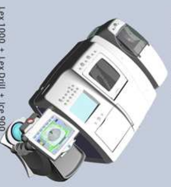
Lex 1000 + Lex Drill + Ice 900

*LE-9000 and LE-9000Express are also connectable.