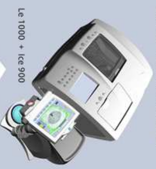
Le 1000 + Ice 900