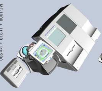
ME-1000 + LT-910 + Ice 900